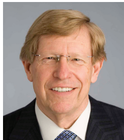
Theodore B. Olson